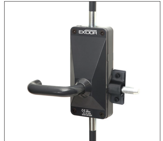
703L/30 | 733L/30

Steel door - 733L/30S Timber door - 733L/30T