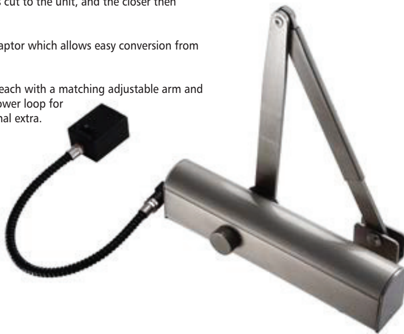
4870 B slide